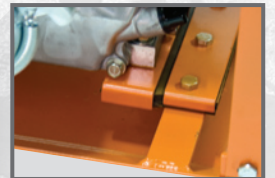
Anti-Vibe Engine Mount

POWERED by HONDA Advanced 4 Stroke Technology