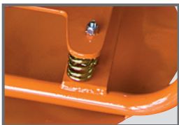
Anti-Vibe Engine Mount

POWERED by HONDA Advanced 4 Stroke Technology